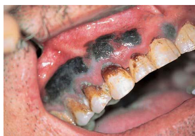
nodular melanoma of maxilla (alveolar mucosa)