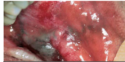
Addison disease: diffuse pigmentation of the buccal mucosa