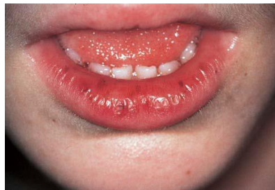
multiple round spots on the lower lip