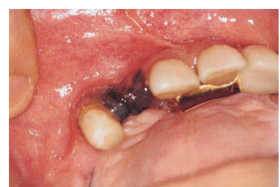
early nodular melanoma of alveolar mucosa