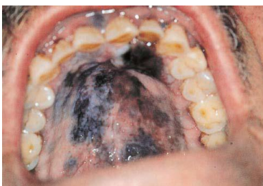
Extensive melanoma of the palate

Treatment Surgical excision with 3 centimeters margin to avoid recurrence, radiotherapy, chemotherapy.