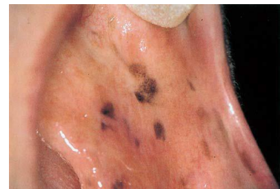
multiple spots on the buccal mucosa